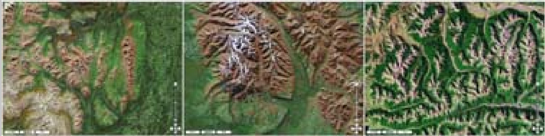
Fig. 11. The Southern Alps, The Cherskiy Range, The Ural Mountains, excerpts at scale ca. 1:500 000