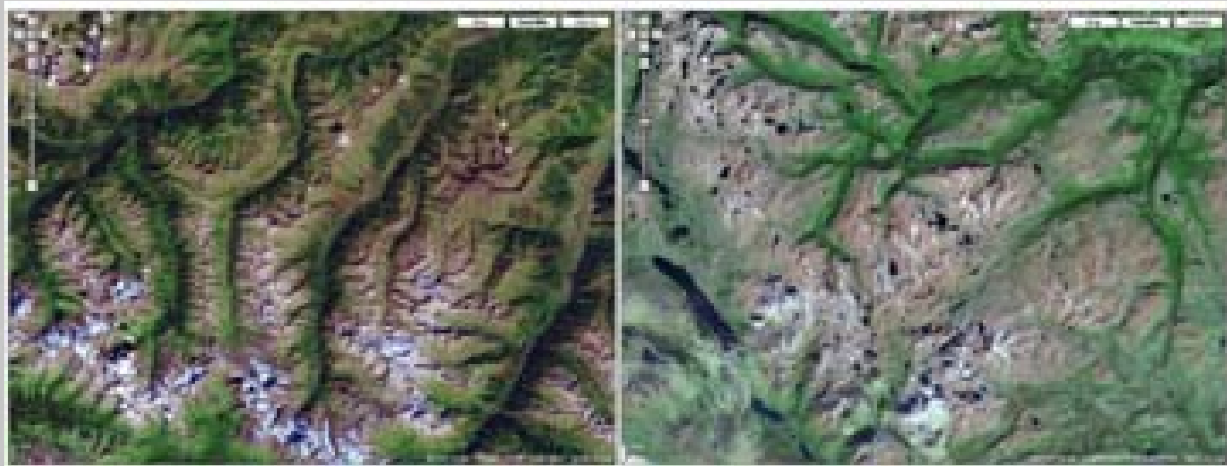
Fig. 9. The Caucasus Mountains and The Scandinavian Mountains, excerpts at scale ca. 1:500 000

The mountains themselves are shaped in different way with the tops sharp or flattened and smooth.