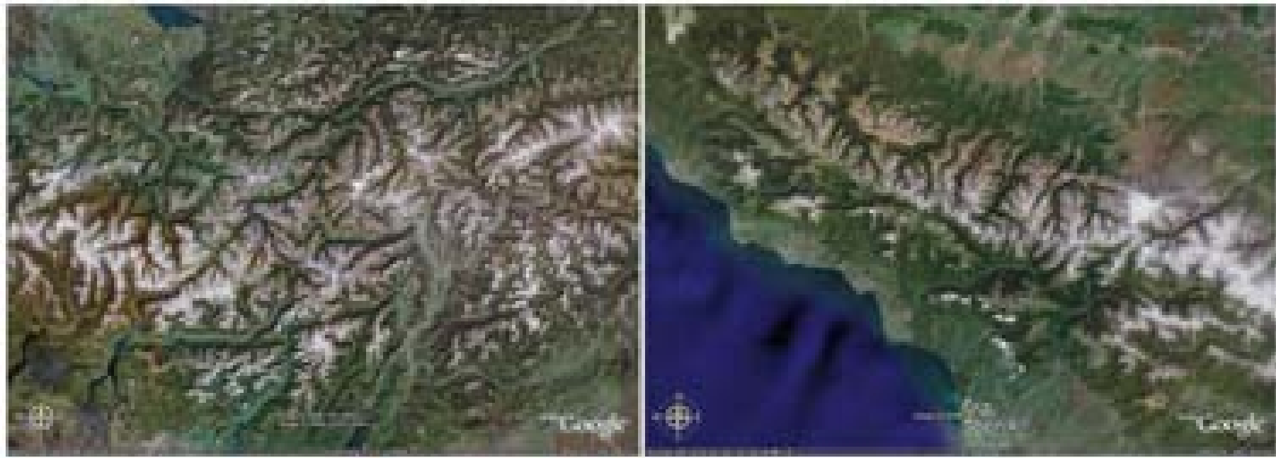
Fig. 6. The Alps and The Caucasus Mountains at scale ca. 1:5 000 000

Mountain areas, cut by apparent valleys look in images different than on maps. On physical maps with hypsometric colors the whole mountain area is orange, on shaded relief maps the area has several gray tones. Consequently, the mountains in the image occupy less space but their structure can be seen more easily. The structure is still enhanced with white outline when the tops of some higher mountains are covered with snow or ice. Mountain areas appearing as a system of chains and blocks are easier to perceive and understand. Their look is also better related to the real character of the location.