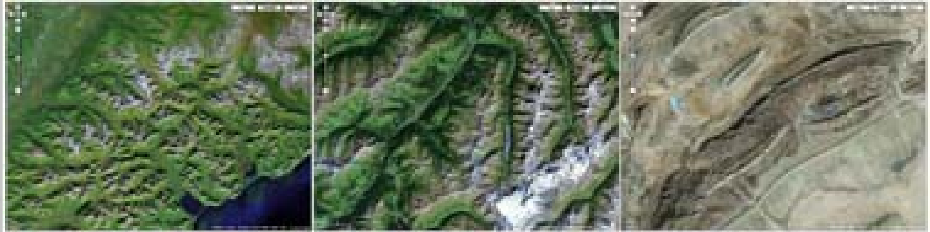
Fig. 8. The Olutorskij Hrebet, The Alps and The Atlas Mountains, excerpts at scale ca. 1:500 000

Mountain systems appear in images as different spatial structures. They are composed from isolated mountains or they form chains separated by passes or they are made of ridges.