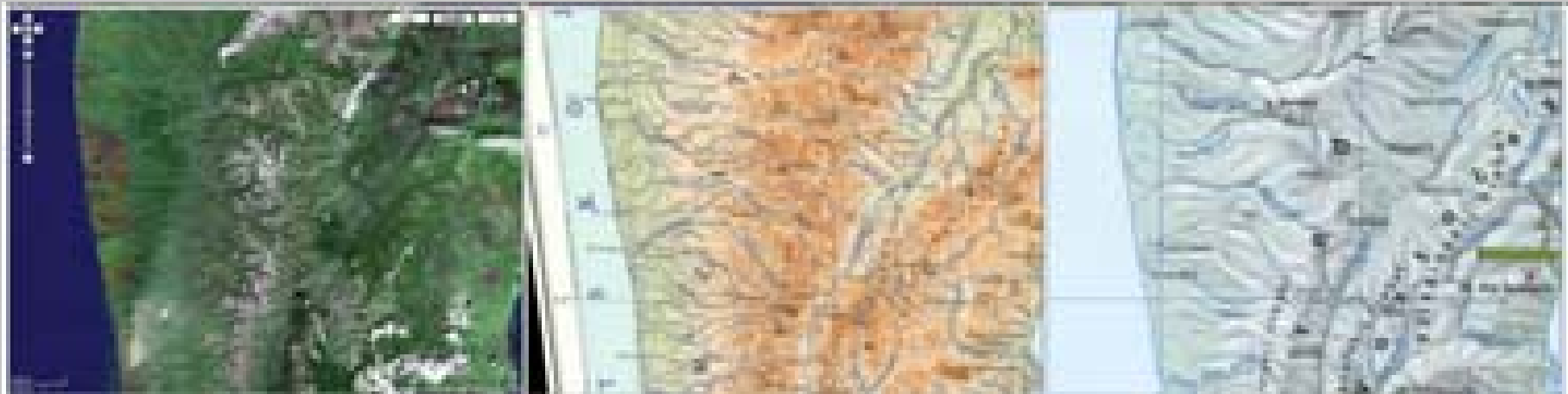
Fig. 7. Sredinnyj Hrebet on the Kamchatka Peninsula, excerpt at scale ca. 1:5 000 000