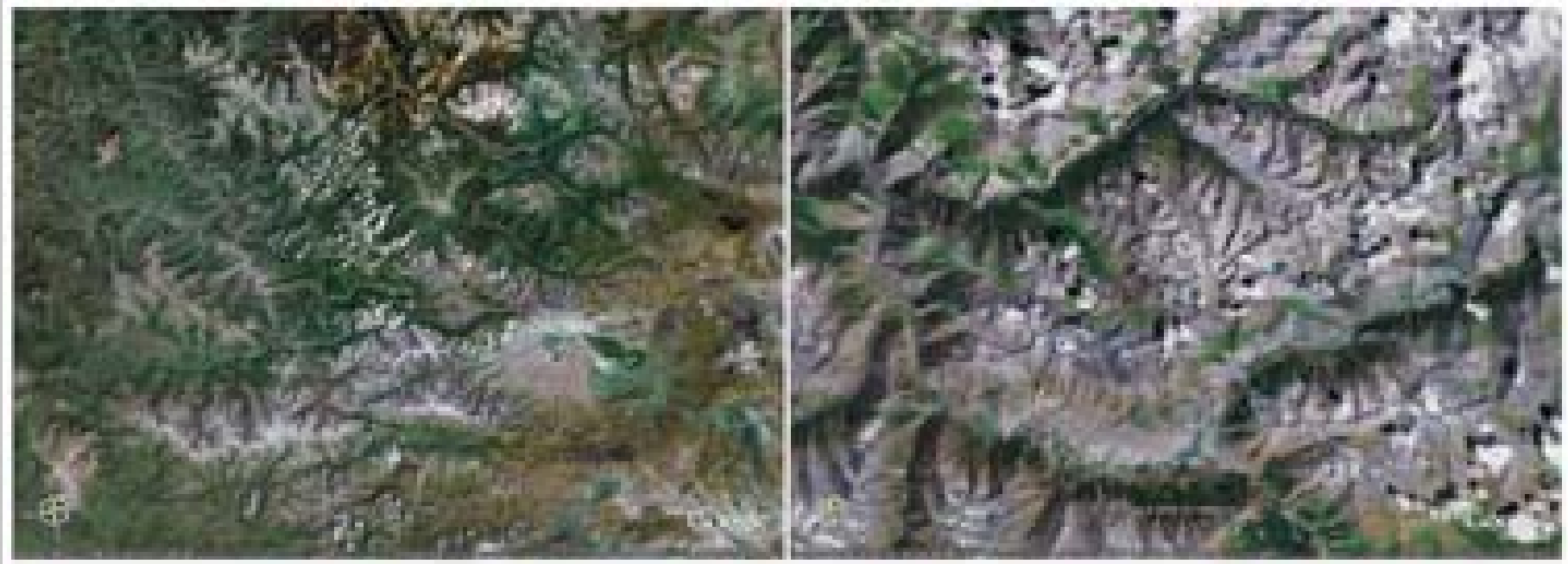
Fig. 4. Altay Mountains at scale ca. 1:5 000 000 and the enlarged section at scale ca. 1:500 000