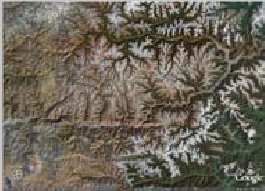
Fig. 5. Himalaya Mountains, excerpt at scale ca. 1:500 000

Amazingly visible are the valleys. Viewing the image we can see clearly that mountain areas consist not only of mountain chains but also of valleys which are not so apparent on popular small scale maps. Some valleys in the image look more distinct because of color contrast between green forests and mountain tops in beige.