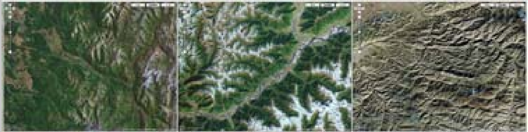
Fig. 10. The Andes, The Himalaya, The Himalaya, excerpts at scale ca. 1:500 000

Besides the form there is vegetation which makes the variety of mountain appearance in satellite images. It is the presence of vegetation or lack of it that amazes the observer with sometimes strange combination of colors.